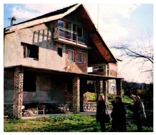
Safe House in Banja Luka, 2003. Newly bought house, later adapted as shelter for women and children survivors of violence

Also, it was very important to establish a dialogue between women from all parts of BiH and between people from all ethnic groups . Connecting with other women groups in BiH contributed to the prevention of women trafficking, better response to domestic violence, and work on peacebuilding.