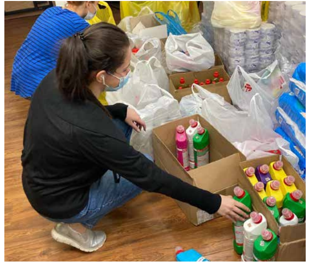
Organization and distribution of support packages in Armenia

The very real problems of menstruating girls and women in war zones are bound to be ignored in many countries all over the world when the lens through which humanitarian support is provided is patriarchal and lacks gender sensitivity.