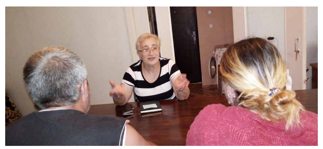
Work with a couple at Women Fund Sukhumi

It turned out I had many problems... a psychologist and a social worker were thinking and helping me to solve these problems. Professionals have been taking care of my children. After working with a psychologist, I felt relieved. Now, I want to erase from my mind 31 years full of pain and hardships, where there was not a single bright spot. For two weeks, I got back on my feet, reassessed my life, and looked at it differently. I learned a lot and now I'm not afraid of tomorrow.