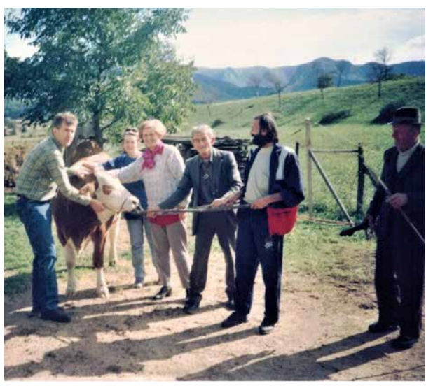
Entity border of Republic of Srpska and Federation BiH, 1997. Activities of the United Women Foundation to improve the economic empowerment of women in rural areas.